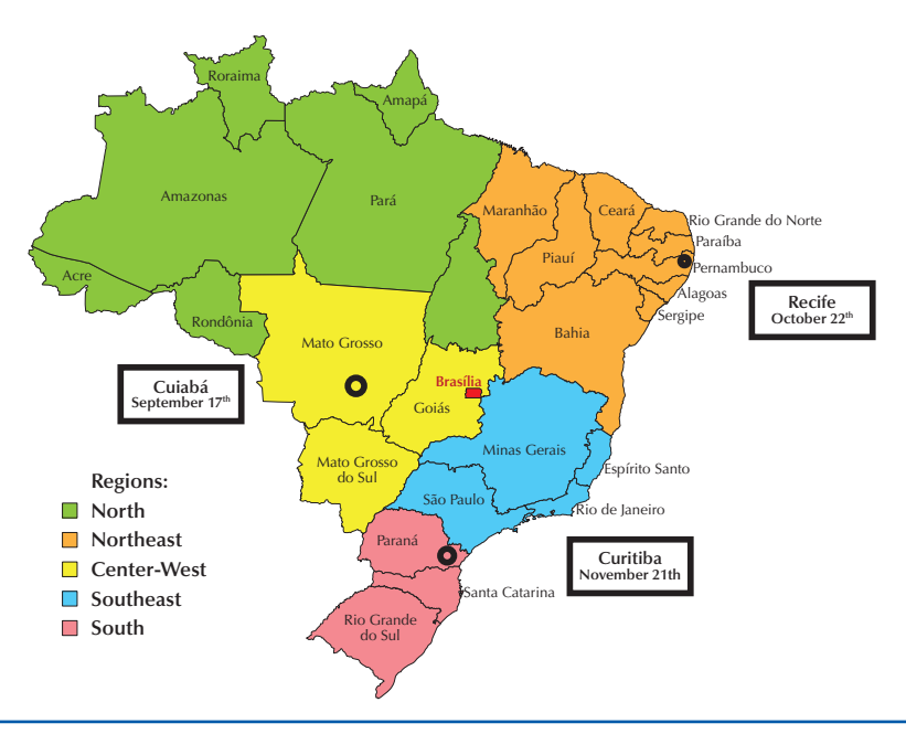
Figure 1 Location and dates of regional outreaches.

Biofuel stakeholders and civil society in Brazil are in urgent need to access information about the potential impacts and benefits of the many aspects of the biofuels industry, including jet fuel, and to be recognized as key stakeholders in the process of deciding which are the best options (politically, socially, environmentally and economically) towards a more sustainable development as the industry expands. To better promote an understanding of the challenges and opportunities for the developing Brazilian aviation biofuel sector, 4 Cantos do Mundo and EPFL Energy Center, sponsored by The Boeing Company, delivered three regional outreach workshops, in different parts of Brazil, from September to November 2012, the results of which will be linked with the Sustainable Aviation Biofuels for Brazil roadmap. A separate and more detailed report was prepared for each regional outreach, in Portuguese, which can be available if requested.