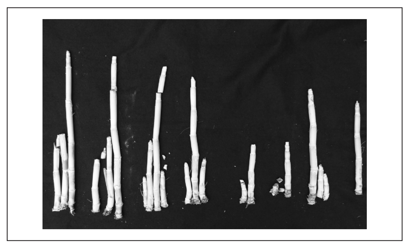
FIGURE 2 Culms of sugarcane after 75 days growing in open top chambers (OTCs) with elevated CO<sub>2</sub>. Left (four groups of culms) = control; right = grown in OTCs.

On the other hand, WU and BIRCH (2007) showed that the increase in sink strength in sugarcane lead an increase in the electron transport system which was followed by increase in the concentrations of sucrose in internodes under intermediate stage of development.